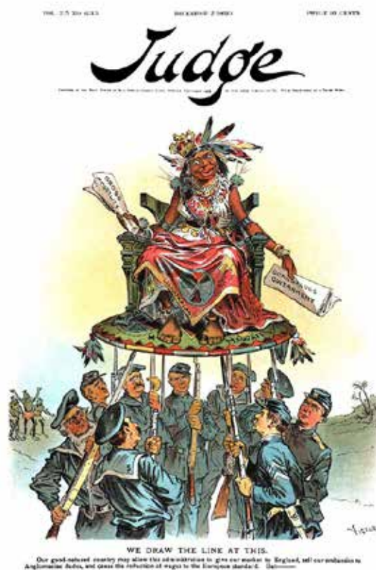
The December 1893 cover of Judge magazine featured a caricature of Queen Lili'uokalani being dethroned by armed American soldiers. The artist's aggressive imagery and the phrase "We draw the line at this" presented the event as a hostile takeover by the U.S. government.

Lili'uokalani in 1893. Why was the Hawaiian language banned? Did that action change the way native Hawaiians communicated with each other?