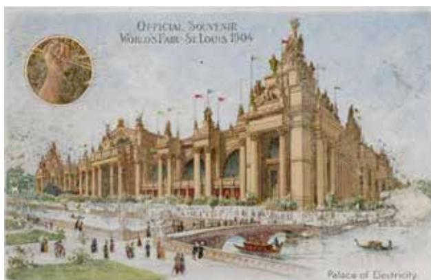
The 1904 World's Fair in St. Louis, Missouri, featured a Palace of Electricity meant to showcase the United States' achievements in commercializing electricity.

Conventions, exhibitions, movements, and other public gatherings help people communicate ideas and opinions with each other. For instance, World's Fairs (also known as World Expositions), in which nations showed off their most recent advancements, exploded in the 1800s. Visitors came from all over the world. Why might countries want to communicate their achievements? What specific ideas and information did the nations show the world, and why might that be important?